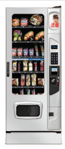
Shown with platinum door and kick panel options.