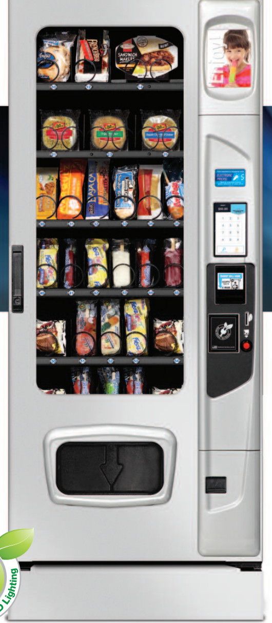
Shown with platinum door styling, iCart touch screen and kick panel options.

High capacity with a small footprint. This high capacity stand alone food and frozen machine that fits through a 32" doorway. The Combi 3000 features next generation air flow architecture allowing it to dispense refrigerated AND frozen foods from the same machine using a common delivery fall space.